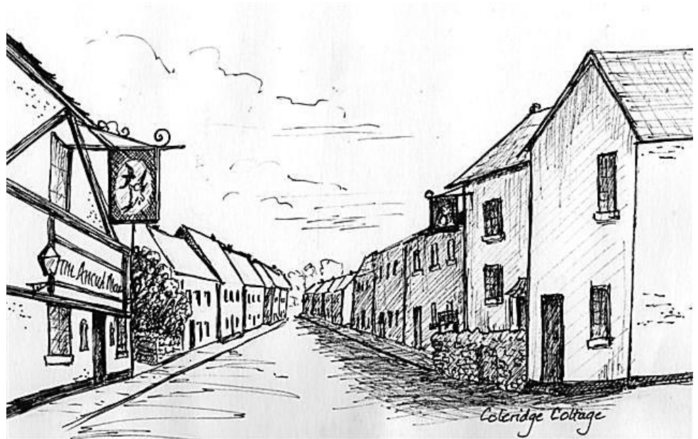
Lime Street, Nether Stowey