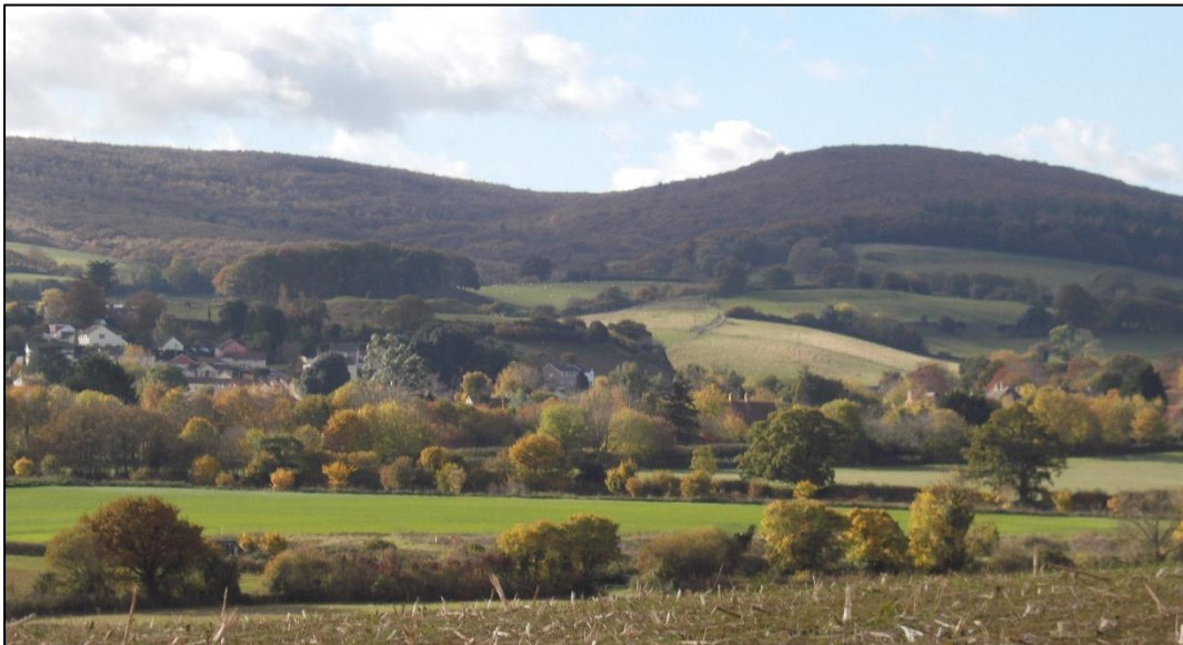
View of The Quantocks with Nether Stowey in the foreground

The details of this walk were correct at the time of publication but may be subject to minor changes particularly when walking over farmland. Footpaths may be subject to diversion, please follow local signs on the ground. If you have any problems or feel the directions could be clearer please contact Stowey Walking via our website: stoweywalking.co.uk